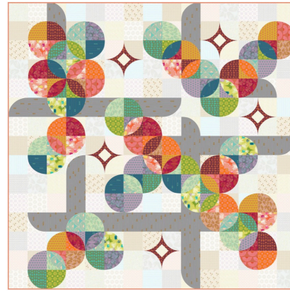
“MOON DANCE REVIVAL”